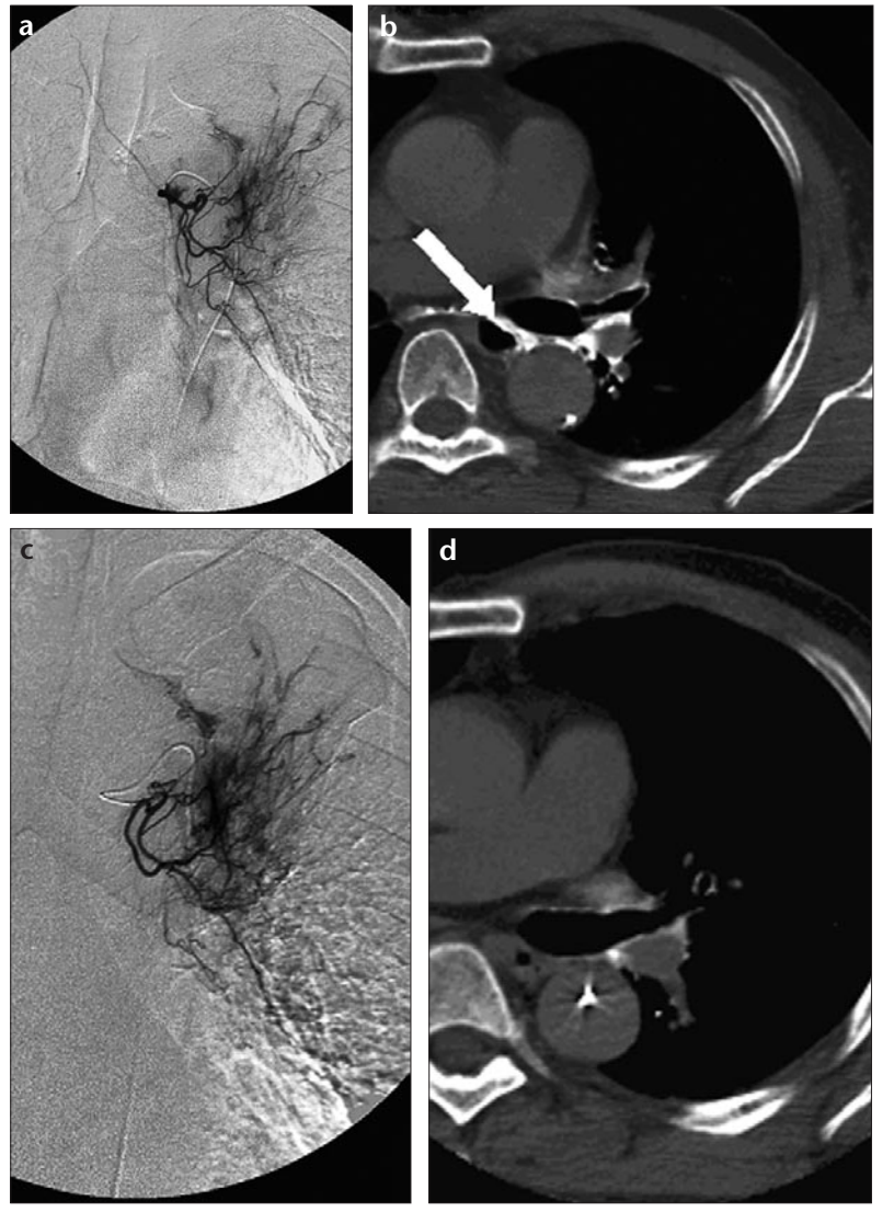
Figure 3. a-d. Patient no 14. Angiogram via the origin of the left bronchial artery (a) shows hypertrophic arteries that supply a hypervascular lesion in the left upper lobe. There is bronchopulmonary shunting with visualization of the branch of left upper lobar pulmonary arteries. Neither spinal nor esophageal branch is shown on angiography. CT angiogram via the origin of the left bronchial artery (b) shows an esophageal wall enhancement (white arrow) . Spinal cord enhancement is not shown. Superselective angiogram via the left bronchial artery with coaxial microcatheter (c) shows hypertrophic arteries that supply a hypervascular lesion in the left upper lobe. Neither spinal nor esophageal branch is shown on angiography. Superselective CT angiogram via the left bronchial artery (d) . Esophageal wall enhancement that is shown on CT angiogram via the origin of the left bronchial artery disappeared, and then, bronchial artery embolization was performed.

inadvertent effects on the spinal cord or esophagus. Moteki et al. performed both DSA and CT angiography from the origin of the bronchial artery for 21 patients, but neither spinal nor esophageal branches were detected by DSA in any of their patients, although enhancement of the spinal cord was observed in 8 (38.1%) and enhancement of the esophageal wall in 18 (85.7%) on CT angiography (12). Their report confirmed the existence of extremely small anastomoses between